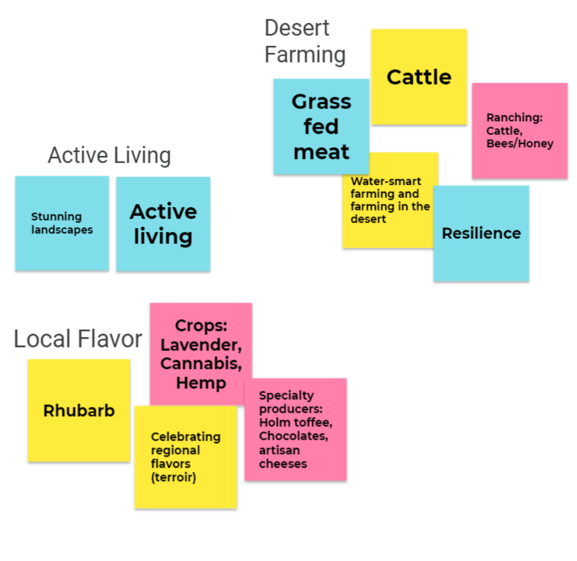
Top 15, organized into 4 categories)