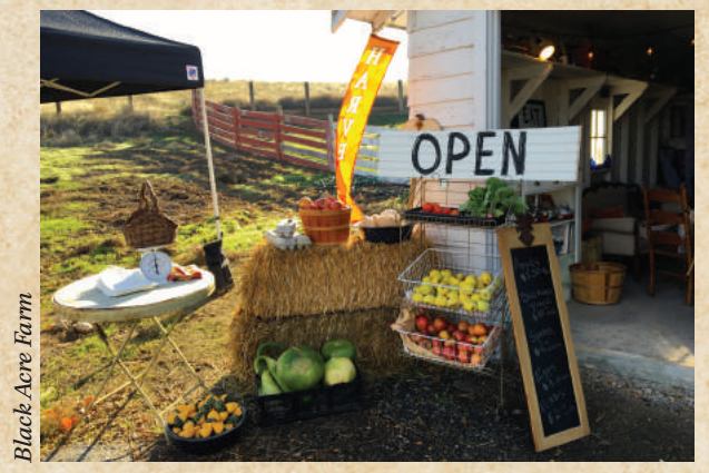
Black Acre Farm

Taste the winery's fine wine and tour the renovated historic building housing it in the heart of Echo. The furnishings and intriguing decor reflect the couple's world travels and interests. Wed. and Thu., 11am - 6pm; Fri., 11am - 8:30pm; Sat., 12pm - 6pm