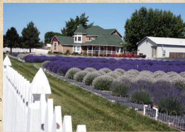
Purple Ridge Lavender

6 Purple Ridge Lavender 29081 Bridge Road Hermiston, OR 97838 541.561.3945 purpleridgelavender.com