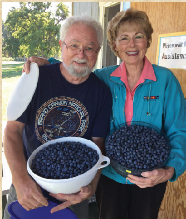
K & K Blueberries

8 K & K Blueberries 29555 Minnehaha Road Hermiston, OR 97838 541.567.3146 kandkblueberries.com