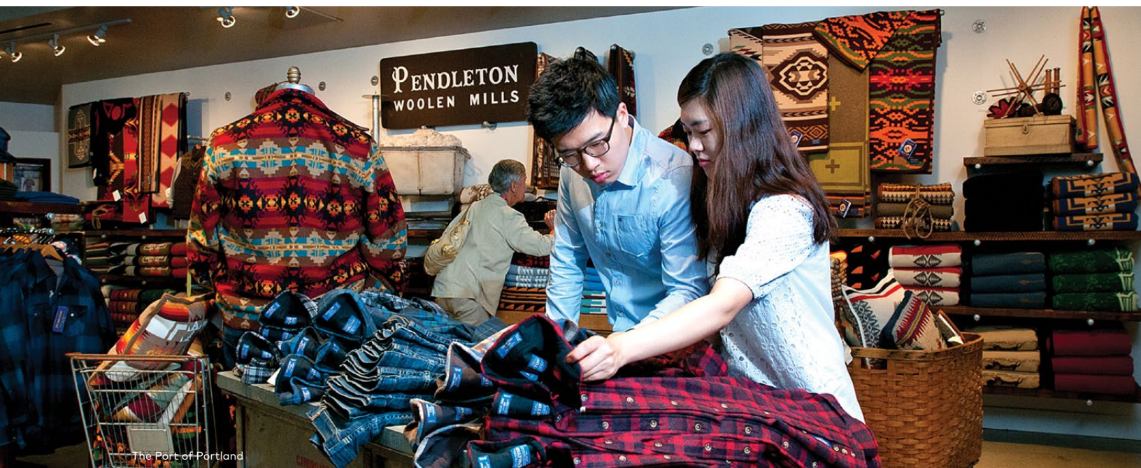
The Port of Portland