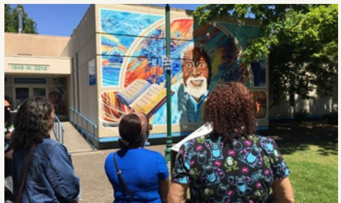
Stop on the Strides for Social Justice tour

Strides for Social Justice — a PeaceHealth initiative developed in partnership with the Eugene Marathon — recently launched as an inclusive, family-friendly app