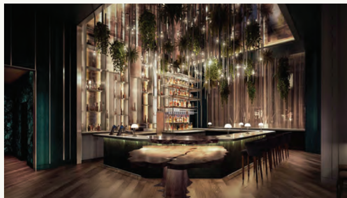
Ritz-Carlton lobby bar, a mystical forest

The highly anticipated Ritz-Carlton Portland will debut in April. Located in the heart of downtown, this marks the brand's first property in the Pacific Northwest. The stunning 35-story building includes 251 state-of-the-art hotel rooms and two amenity floors with a sublime indoor pool, a fitness center and a full-service spa. Also an emerging hub for boutique shopping, the $600 million development will showcase high-end retail, a ground-level food hall and a swanky restaurant and lounge on the 20th floor.