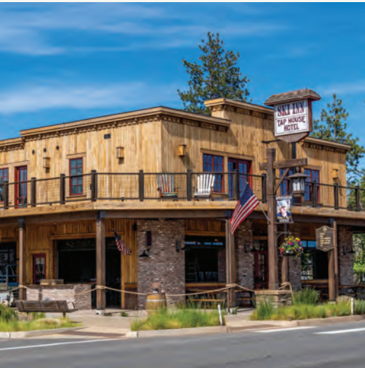
Ski Inn Tap House Hotel

One of the bright spots of an Oregon winter is the Oregon Truffle Festival . At this annual winter fête that celebrates the state's wild black and white truffles, you can indulge in exceptional wine truffle dinners, attend lectures with renowned mycologists and experience guided truffle forays with trained truffle dogs. Joining the truffle mania is one of wine country's top towns: Newberg's Truffle Month kicks off in February with creative lodging packages and culinary specials. Book with Black Tie Tours for a custom wine-country Truffle Tour that includes foraging with a truffle dog, a truffle-themed lunch and local wine pairings.