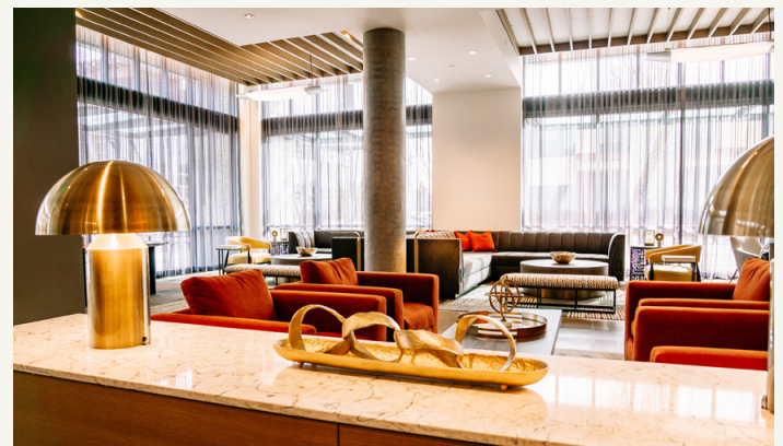
Holman Riverfront Park Hotel