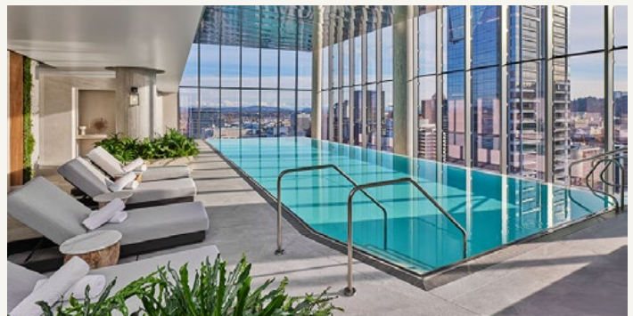
The Ritz-Carlton, Portland

When traveling to the Southern Coast, there's a new reason to swing by the Elkton Oregon AVA with the opening of Haines Creek Vineyard . At this husband-and-wife-owned spot, you