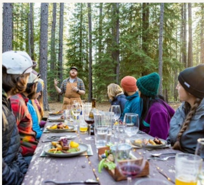
Wanderlust Tour's Forage to Table

In Central Oregon, pair culinary delights with outdoor adventure this winter and spring. Mt. Bachelor offers a flurry of ski classes and a series of new Moonlight Dinners — a feast at Pine Marten Lodge followed by the thrill of skiing under the stars. Wanderlust Tours hosts an enchanting Snowshoe & Fireside Dinner in the Deschutes National Forest with partner Luckey's Woodsman . Plan ahead for Forage to Table , a four-course feast set for late spring.