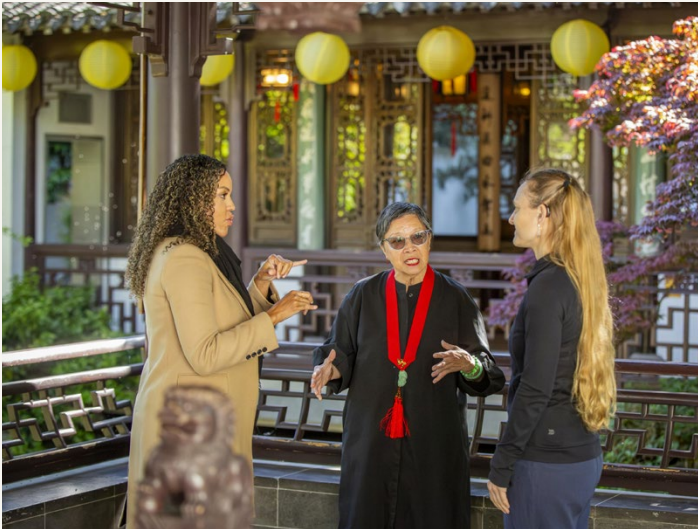
Lan Su Chinese Garden in Portland was part of the Wheel The World “Destination Verified” assessment in the Portland Region.