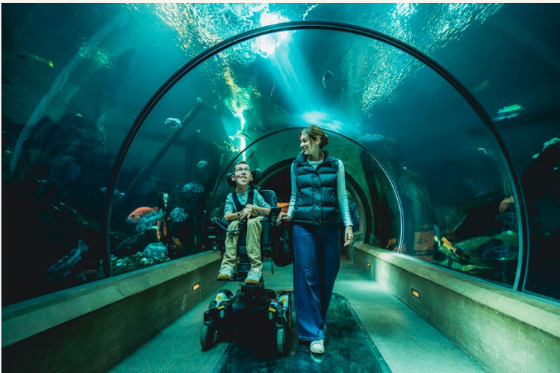
The Oregon Coast Aquarium in Newport was part of the Wheel The World "Destination Verified" assessment in Central Oregon.